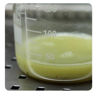
Oil contaminated by flushing agent, milky discoloration