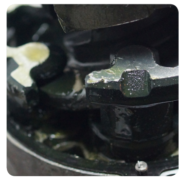
Crystallized leak-stop agent thickened the oil, creating visible snots on wobble plate and pistons

©Nissens A/S, Ormhøjgårdvej 9, 8700 Horsens, Denmark. For further technical and contact information visit our website www.nissens.com.